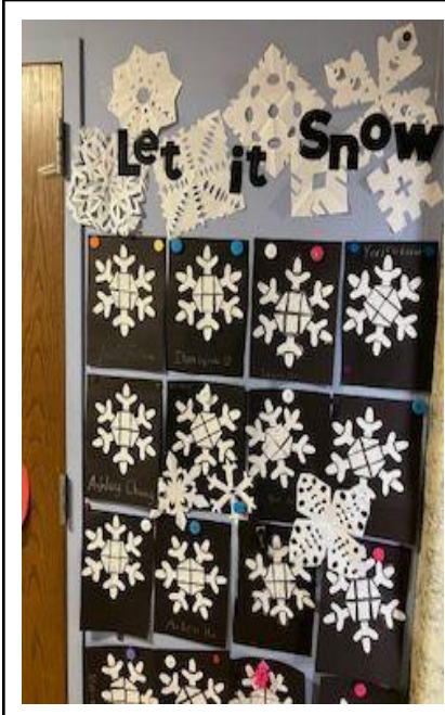
3JL displays their snowflake math artwork.